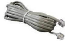
DSL Cable (RJ11)