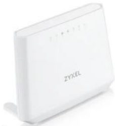
Front of Router* (model may vary)