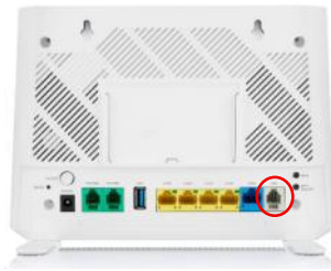
Rear of Router*