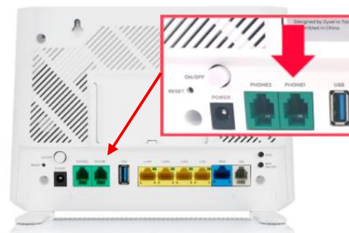
Green ATA (Analogue Telephone Adapter) ports: use Port 1

Please note: The RJ11 (6-pin) and RJ10 (4-pin) may look similar but they are different and are not interchangeable. Cables with RJ10 plugs are not suitable for use in this setup.