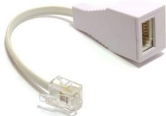
BT Socket to RJ11 Adapter (to be used to connect UK analogue handsets to the router)