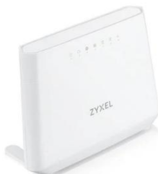
Spitfire Managed Router (models may vary)