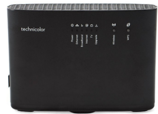
TG588 Router (model may vary)