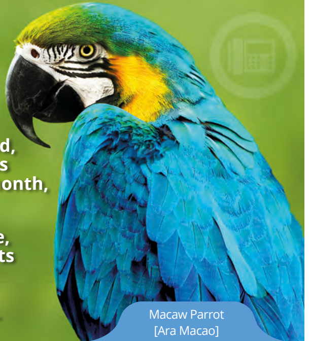
Macaw Parrot [Ara Macao]

Scalable and optimised for use in the office, on the road or at home, 3CX Cloud supports flexible and remote working through web-conferencing, presence, softphones, smartphone clients and desktop handsets.