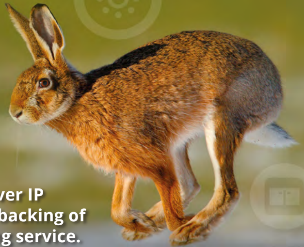
Brown Hare [Lepus europaeus]

The Brown Hare is the fastest mammal in the UK and is perfectly adapted for high-speed endurance running. FTTC Ethernet - perfectly formed for a professional working environment.