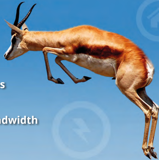
Springbok [Antidorcas marsupialis]

Springbok's can reach speeds of 100 km/h (62 mph), leap 4 m (13 feet) into the air and jump a distance of up to 15 m (50 feet). Spitfire's FTTP - increased bandwidth expanding your horizons.