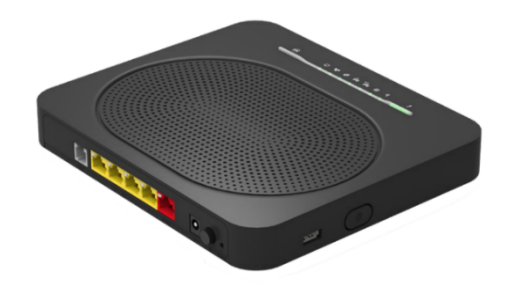
Technicolor DWA0120 (model may vary)