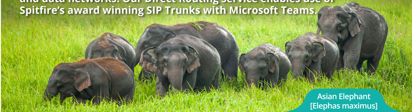
Asian Elephant [Elephas maximus]

Spitfire is one of the UK's leading providers of business VoIP solutions. We offer a complete end to end service via our own resilient voice and data networks. Our Direct Routing service enables use of Spitfire's award winning SIP Trunks with Microsoft Teams.