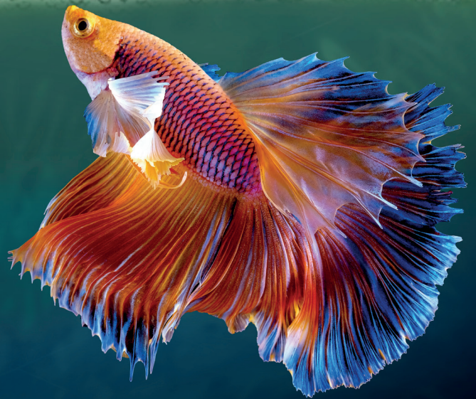
Betta fish [Betta splendens]

The importance of the ability to work from home effectively has been placed front and centre during lockdown, and that doesn't look like it's going away any time soon.