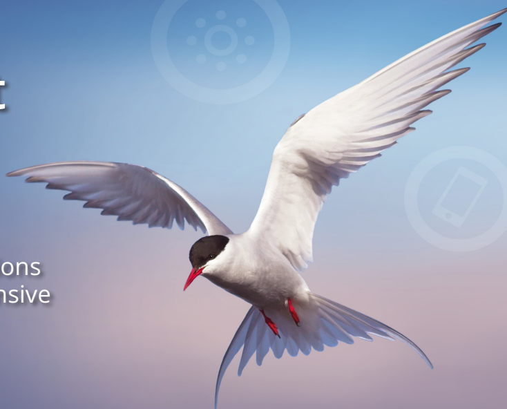
Arctic Tern [Sterna paradisaea]

Our range of Mobile Ethernet solutions utilises EE, O2 and Vodafone's extensive UK mobile networks!