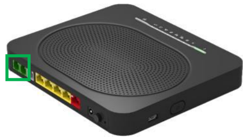
2 FXS/ATA port (receives RJ11 plug) (only port 1 is configured)

Please note: the RJ11 and RJ10 may look the same but they are different and are not interchangeable. RJ10 would not be suited for use in this setup.