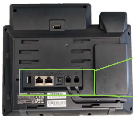
Yealink VoIP Handset (back)