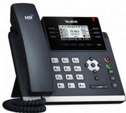
Yealink VoIP Handset (front) Please note your model may vary.

OPTIONAL Power Supply Unit (PSU) Required if site does NOT have a Power Over Ethernet (PoE) Switch.